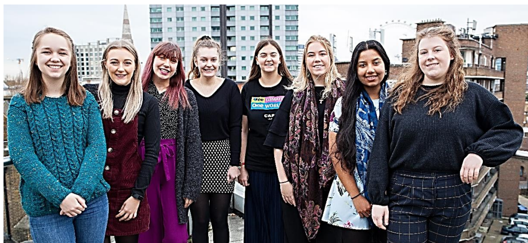
The Step Into the Gap volunteers for 2018-2019.

They also visit a CAFOD project to learn more about our partnership approach, themselves and the world within the context of their faith. This year the groups visited Uganda and the occupied Palestinian Territory, where they shared stories with local people and saw the impact of the Church network first hand.